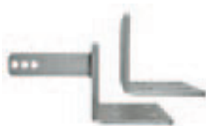
4815 Wooden pole bracket, variable setting from 90 - 140 mm pole strength