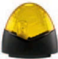
4811 Warning light 24 V, not auto-flashing, E14 lamp fitting, 25 w, with bulb