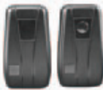
4814 Non-reusable photo sensor, IP 44, surface-mounted, range 10 m, including fitting bracket, AC / DC 24 V