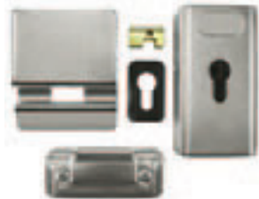
4812 Electric lock 24 V, without profile cylinder, with side and ground locking plate for locking at the side or base