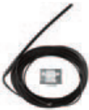
4813 Rod aerial 434 / 433 MHz, external antenna, 50 Ohm co-axial cable