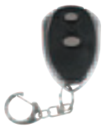
RP-S2-MHS-RF23 2 channel micro manual transmitter 433 MHz