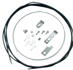
RP-S2-543-02 External release for sectional doors, for manual opening from outside