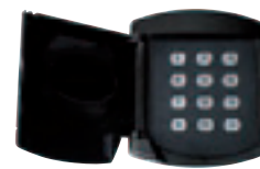
RP-S2-CSG-AF26 Radio code switch 433 MHz