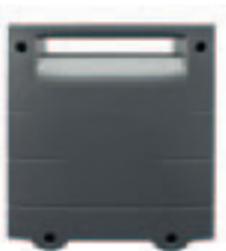
4752 RolloPort S3 - replacement battery pack, external dimensions: 165 x 193 x 80 mm, input 230 V