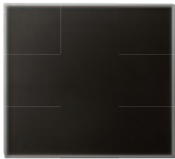
4751 Solar module with charge regulator for use with item no. RP-S3A-400N-D40 / -D45, Dimensions: 330 x 293 mm, weight: 1.6 kg, incl. installation weight and 8 m connecting cable.