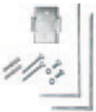
4560-04 Centre suspension