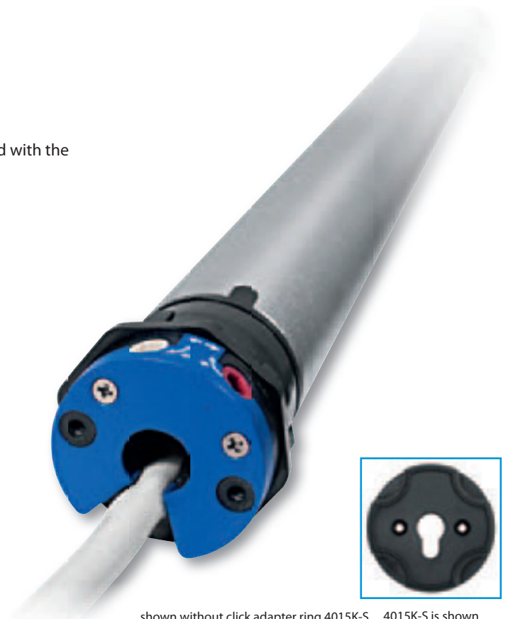
shown without click adapter ring 4015K-S 4015K-S is shown