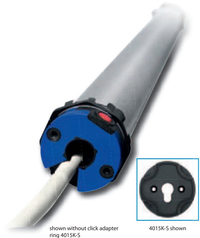
shown without click adapter ring 4015K-S